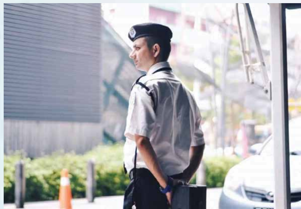
24 hours Gated security