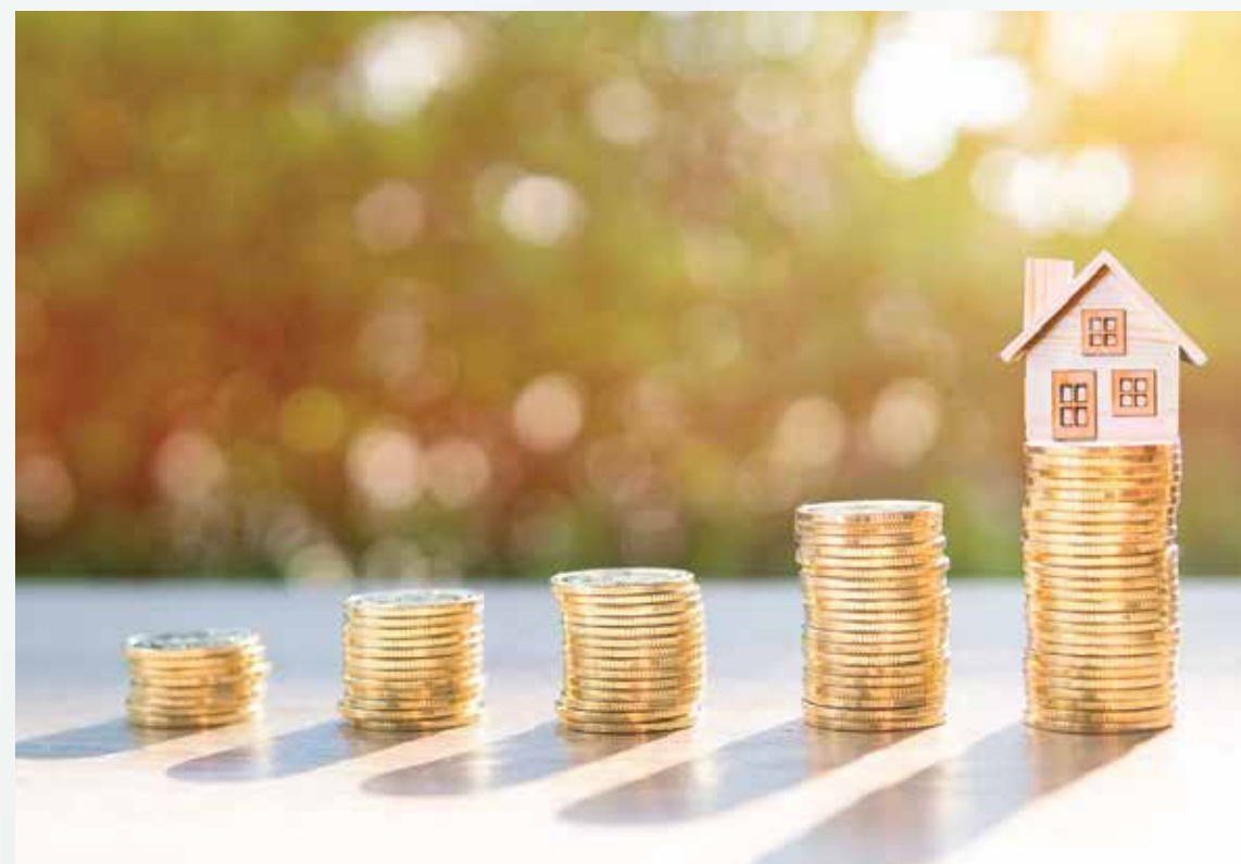
Excellent investment opportunities