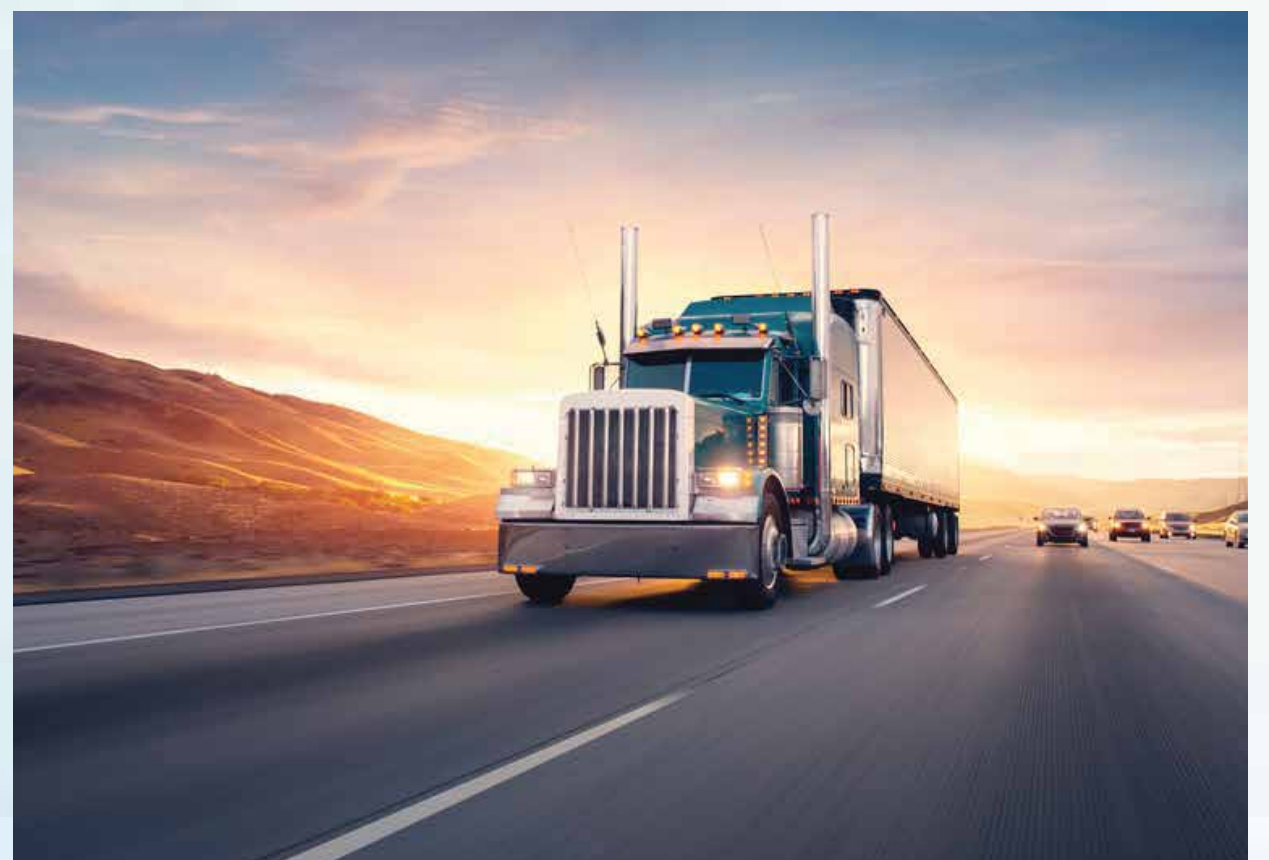
MUMBAI- DELHI EXPRESSWAY