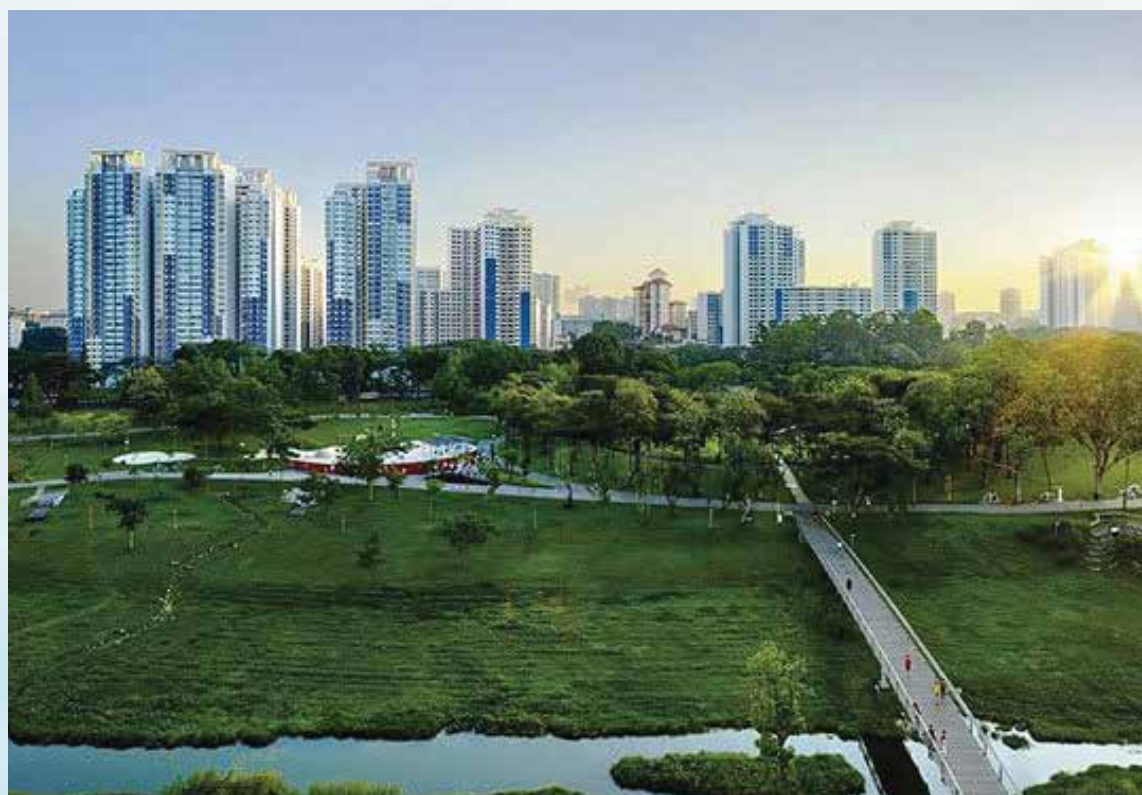
Eco-friendly Urban Life