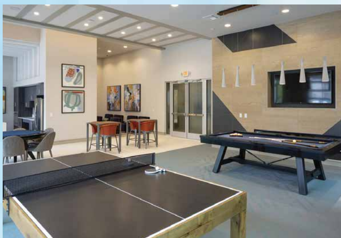
Fully-equipped club house