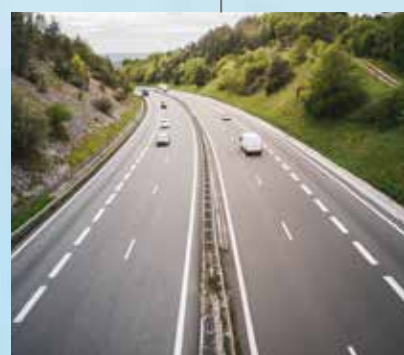
Upcoming Mumbai-Delhi Express Way