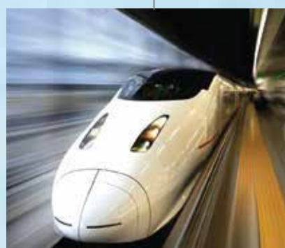
Bullet Train Line