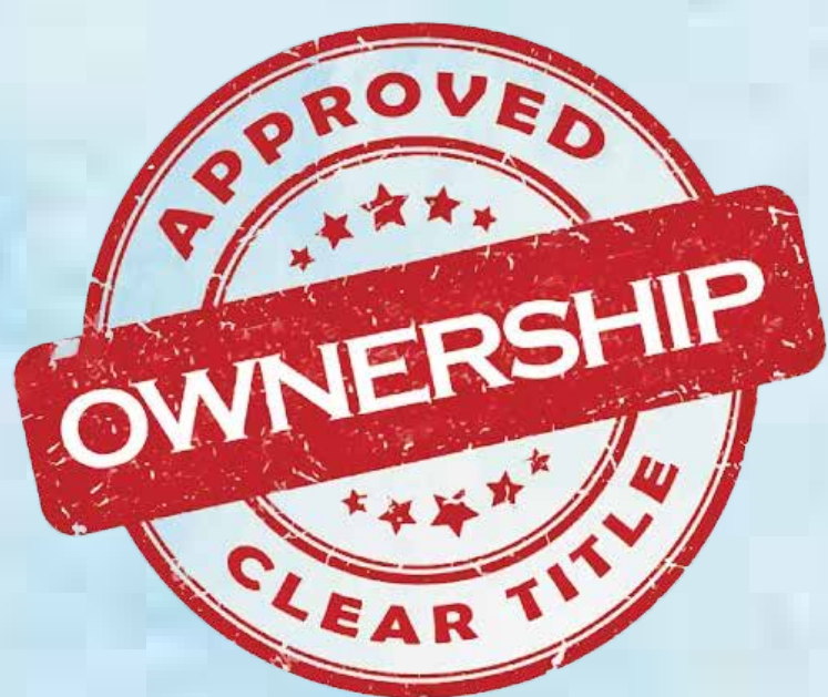
Clear title NA Lands (i.e. Separate 7/12 & Survey Map)